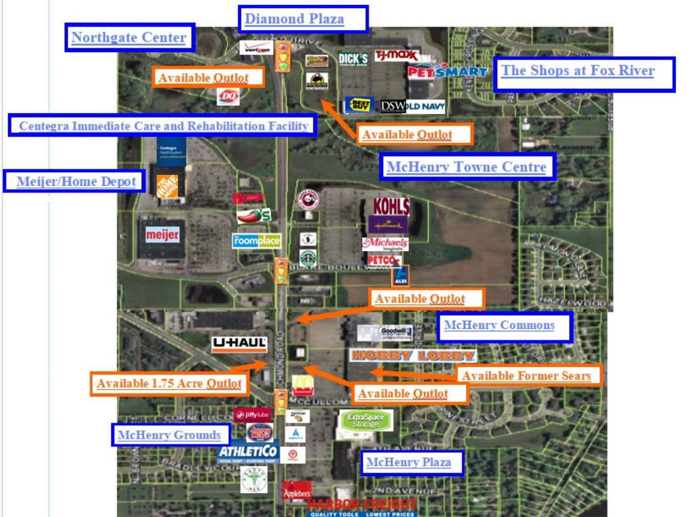
Aerial View of Richmond Road Corridor, Looking North (1,358,353 square feet of total retail space)